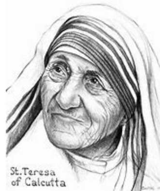
St. Teresa of Calcutta