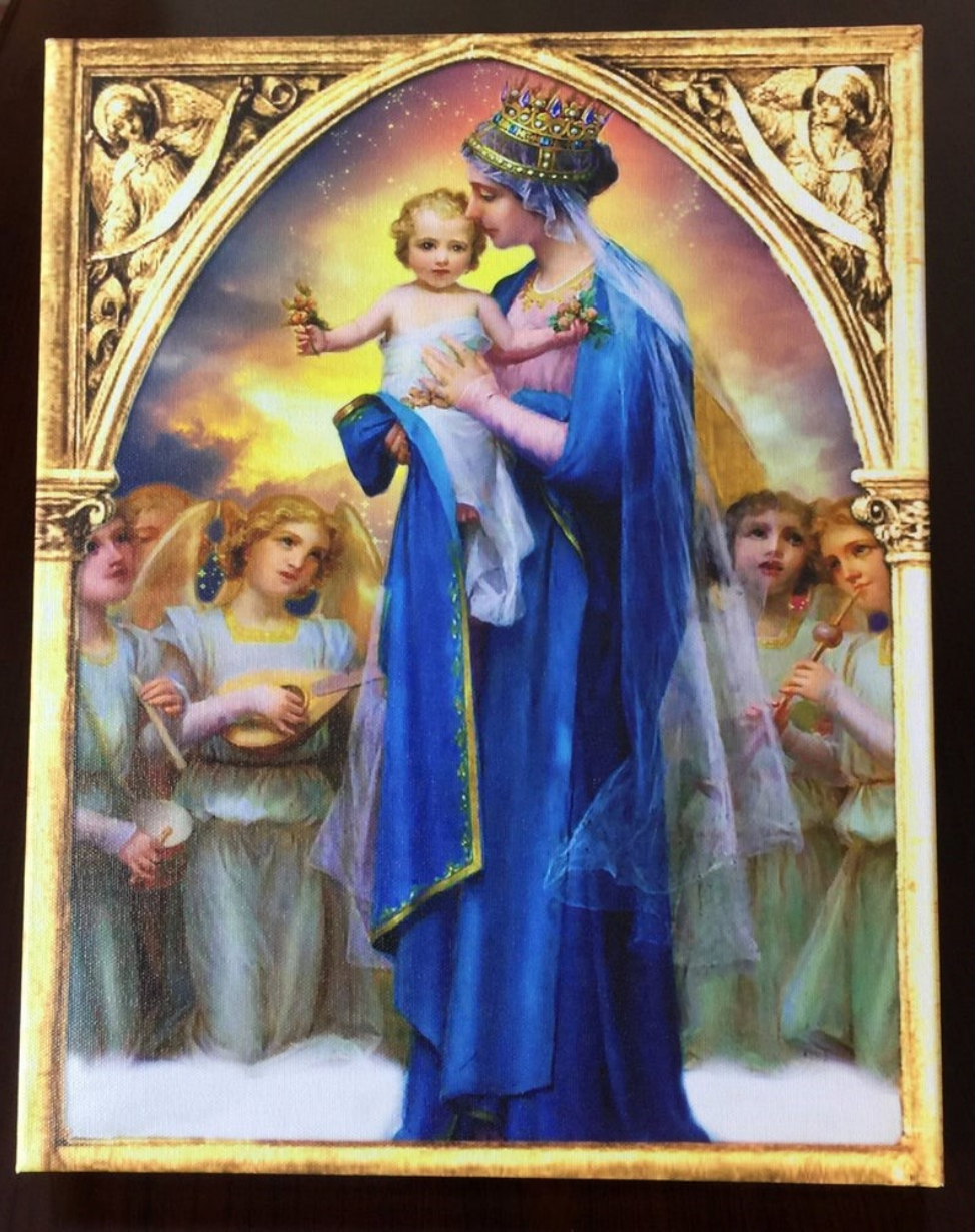
The Queenship of the Blessed Virgin Mary— feast day August 22

MISSION STATEMENT We the members of Saint Joseph Catholic parish, will strive to be the reflection of Jesus in this particular time and place.