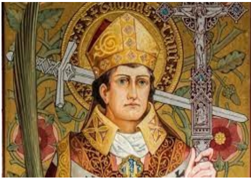
Saint of the Week December 29th

CATHOLIC CHARITIES OF ST. JOSEPH NEEDS YOUR HELP! One of the Catholic Charities' mission is to provide basic needs to families who can't afford the essentials. CC's cupboards are in need of the following items: laundry soap, dish soap, bleach, paper towels, toilet tissue, Kleenex, deodorant, shampoo, soap, tooth paste, tooth brushes, diapers, baby wipes and other items for personal hygiene needs. Just drop them in the box in the back of the church marked "Catholic Charities" at your convenience.