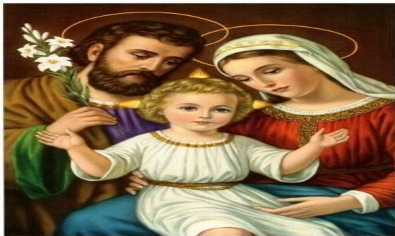
The Holy Family Of Jesus, Mary and Joseph December 30