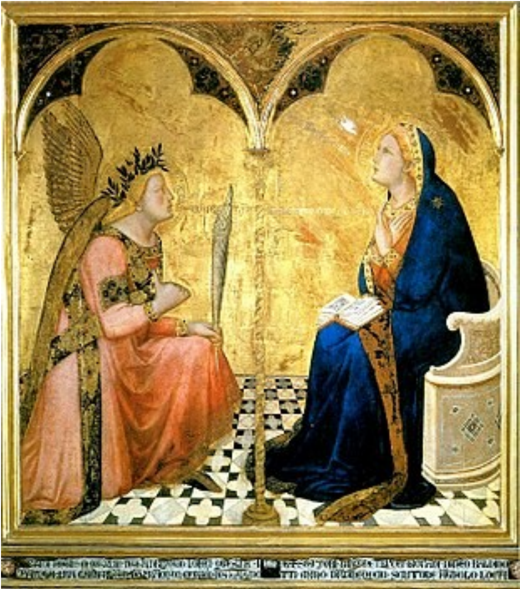
Feast of the Annunciation~ March 25

We the members of Saint Joseph Catholic parish, will strive to be the reflection of Jesus in this particular time and place.