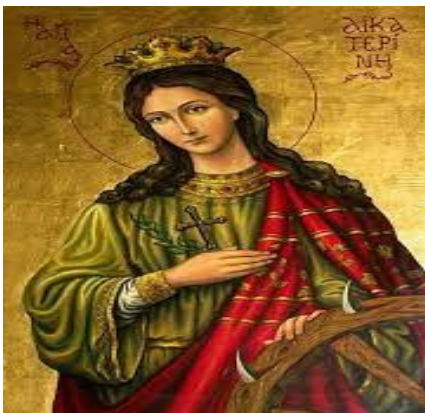
St. Catherine of Alexandria November 25th