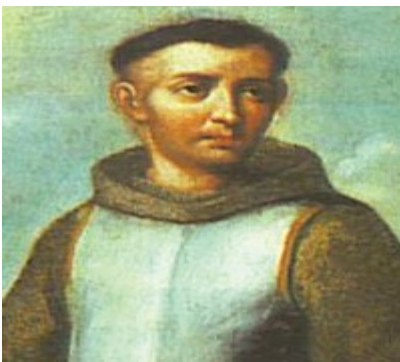
St. John of Capistrano October 23

CONGRATULATIONS & BEST WISHES TO EVERYONE